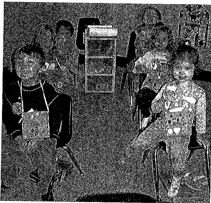
On the plane to Norway

The curriculum at Barnehage is premised on a situated learning model, in which learning to know is not the automatic equivalent of learning to do. Whereas learning to know can involve decontextualized activities such as learning words from a dictionary, performing grammar drills, and memorizing vocabulary, in the situated learning model, knowing and doing are considered inseparable. Learning takes