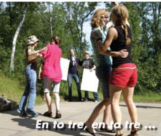
En to tre, en to tre ...