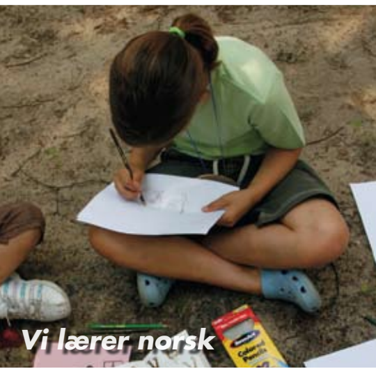
Vi lærer norsk