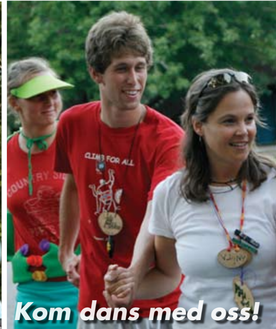
Kom dans med oss!