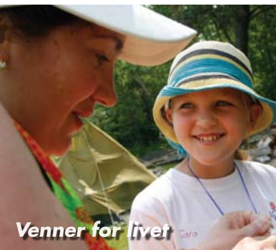
Venner for livet

Life at Skogfjorden is infused with Norwegian. Participants become “villagers” and live in the language and culture from the moment they wake up — participating in small language learning groups, cultural and camp activities, sports, dance, song — to the close of the day. Counselors from the United States and Norway engage with villagers and share experiences using vocabulary repetition and actions to increase understanding and retention.